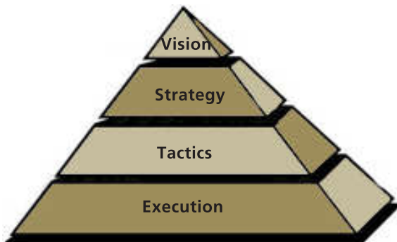
The AGSI Business Pyramid

AGSI Technology Consulting is your partner across the IT project life cycle. Our values ensure that we act with integrity and in the best interest of the client. AGSI is committed to consistently delivering quality solutions that meet business needs and exceed expectations.